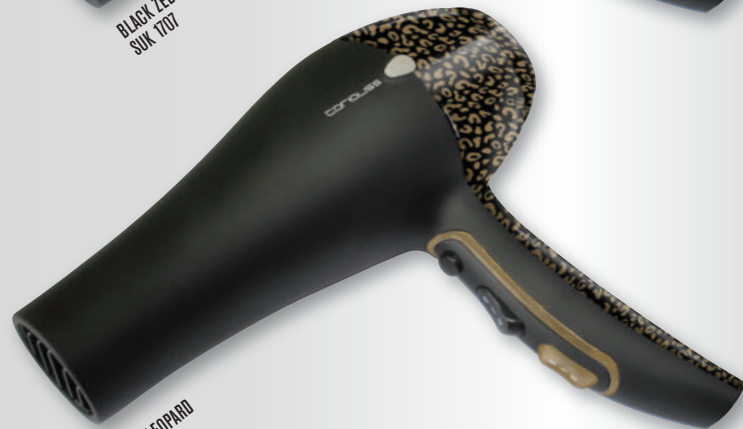
GOLD LEOPARD SKU 1708