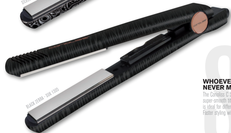
BLACK ZEBRA - SUK 1305