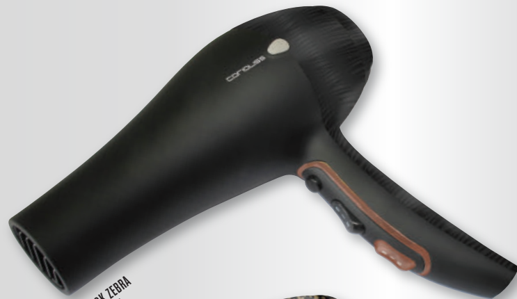
BLACK ZEBRA SKU 1707