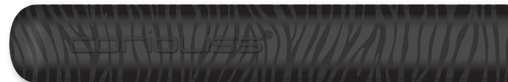
BLACK ZEBRA & METALLIC COPPER - SUK 1025