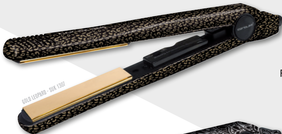
GOLD LEOPARD - SUK 1307