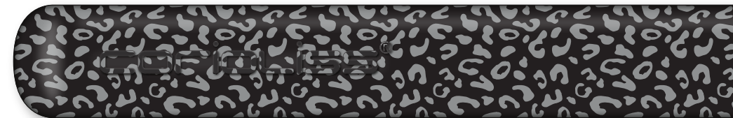
SILVER LEOPARD - SUK 1024