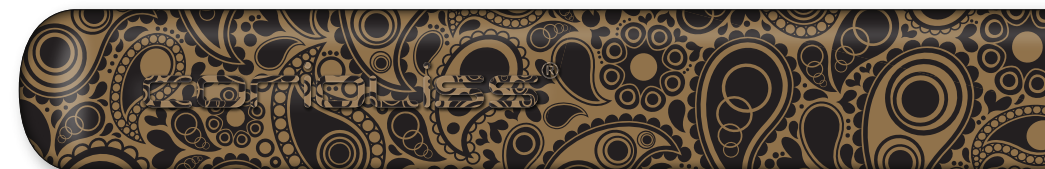
GOLD PAISLEY - SUK 1022