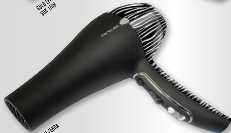
SILVER ZEBRA SKU 1710