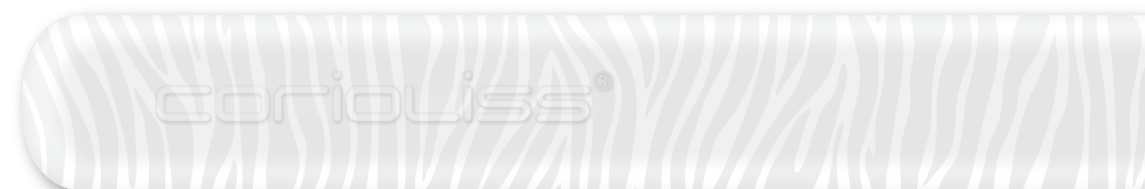
WHITE ZEBRA & METALLIC COPPER - SUK 1026

SALON STYLE CORD professional tangle-free cable for greater freedom. 360° Swivel base allows better movement.