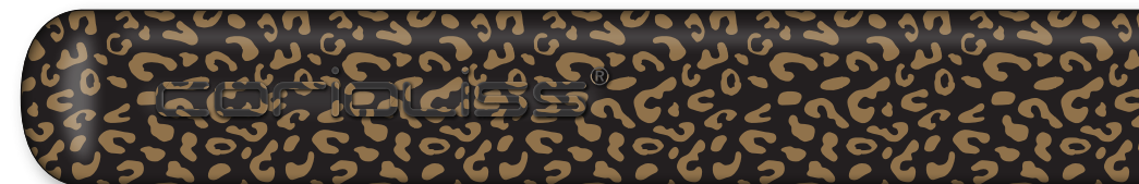
GOLD LEOPARD - SUK 1023