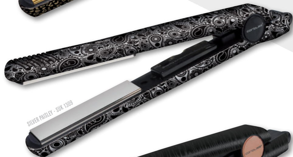
SILVER PAISLEY - SUK 1309