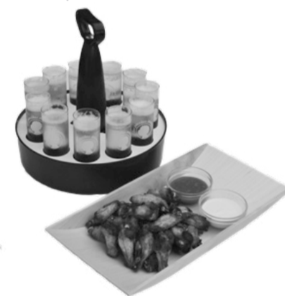
Beer ring, spicy chicken wings (1kg.)