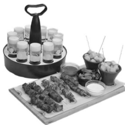
Beer ring, mixed tapas & skewers