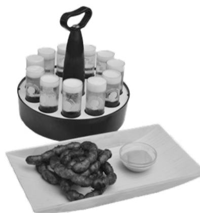
Beer ring, chorizitos (1kg.)