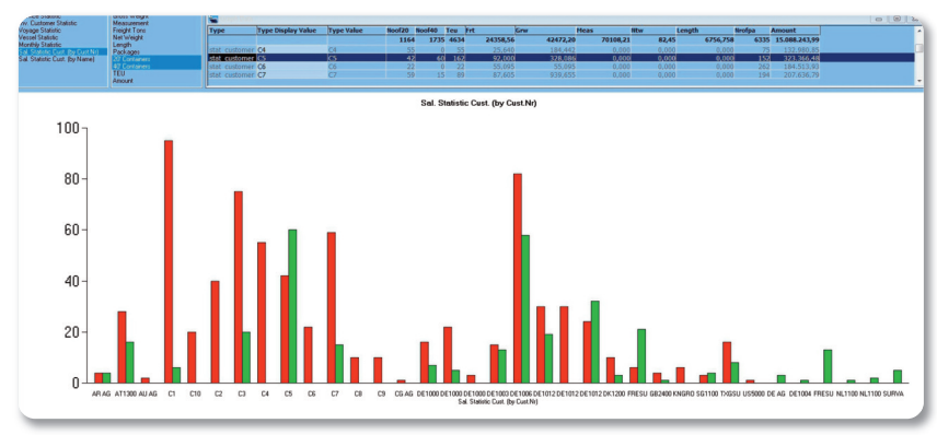
Business performance overview (lifting report)

Since LINE stores and re-uses information, it is a simple process to generate a range of manifests and other relevant documentation. Standard report templates are provided including cargo, freight and dangerous goods manifests as well as reefer lists and loading lists.