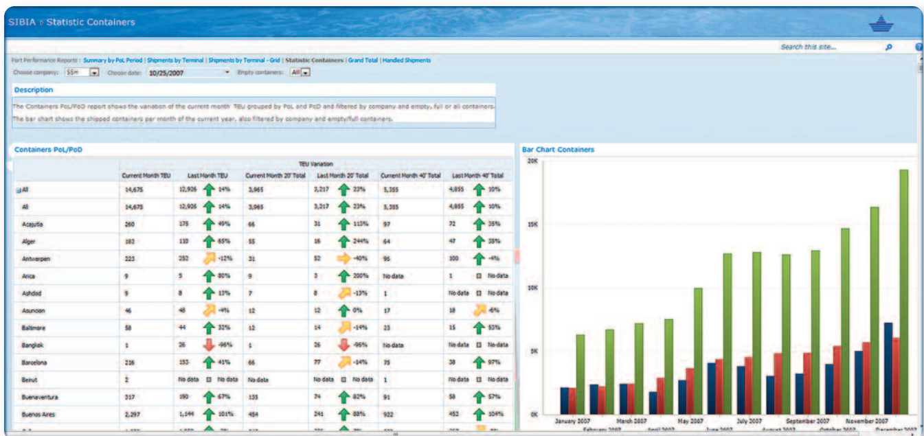
Keeping track of your container liftings

SIBIA takes information from across the company including revenues and costs from all business areas. User-defined data is delivered through a web browser or is accessible via Excel allowing you a